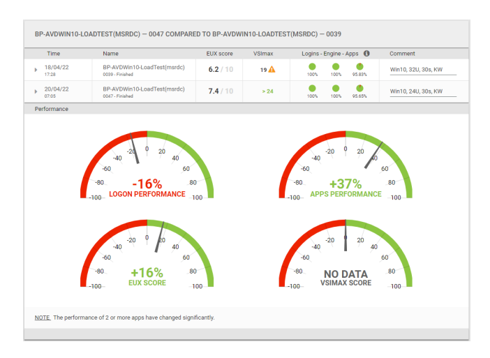
Figure 3 – Benchmark report illustrating end user experience on different Azure Virtual Desktop configurations.

individual experience. VSImax2 uses enhanced algorithms, and EUX Score inputs to determine the true maximum user capacity for DaaS, VDI, and SBC environments. When used together, they become valuable markers to create comparisons that make technology evaluations, change impact decisions, and identify the workspace's overall degradation objective and quantifiable.