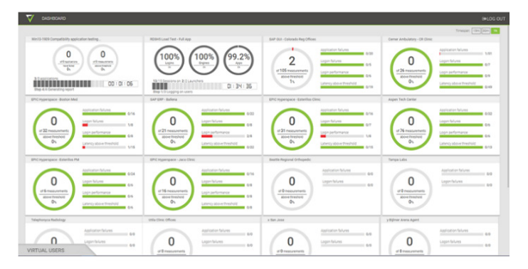
Figure 4 – The main dashboard displays health and performance details, so you can act immediately when any issues arise.

applications are performing. You can quickly detect issues, such as login failures, login delays, latency, or application failures, with insights and alerts. Enhanced reporting features provide SLA reports, trending views, historical analysis, application compatibility, and load testing results in a format easily digested by business stakeholders.