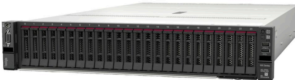
Figure 1. Lenovo ThinkAgile MX650 V3

This high-performance VDI solution with Microsoft Azure Virtual Desktop features the latest Solidigm NVMe mixed use SSDs. These SSDs help build a low latency solution for mission critical VDI environments.