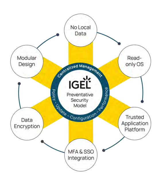
IGEL Preventative Security Model™

IGEL OS is designed around the Preventative Security Model<sup>™</sup> which removes the common attack vectors exploited by bad actors for ransomware and other cyber-attacks.